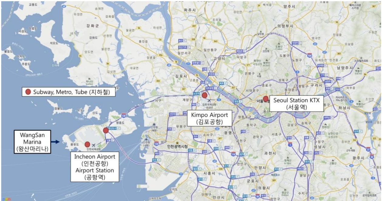
Figure 5. Directions to Wang San Marina (Ashore)